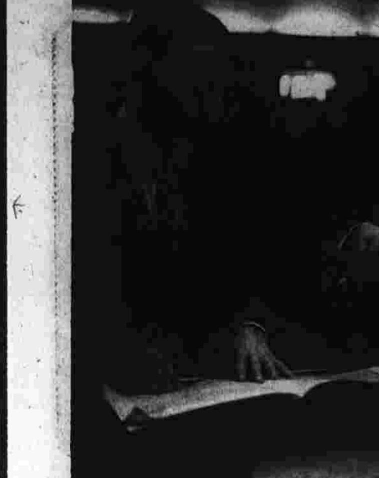
Bomb Explodes Door of Temple CARDIFF, Wales (AP) — A bomb blast smashed the doorway and entrance hall of Cardiff's Temple of Peace today shortly before Lord Snowdon arrived there for a conference on Prince Charles' investiture as Prince of Wales. Police sources blamed the explosion on extremists demanding home rule for the Welsh. As Snowdon, husband of Princess Margaret, calmly entered the meeting hall, demonstrators waved banners outside. One proclaimed: "Republic, not Royalty." The blast broke windows throughout the area, but there were no reports of injuries. Police found evidence of a crude time bomb placed on a shelf above the front doors of the temple — built as a symbol of Welsh devotion to peaceful causes. Another member of the royal family, Princess Alexandra, was on the periphery of a bomb-blast attempt Thursday when she opened a new Ulster government office in Londonderry. A homemade explosive device was found on its steps and dismantled. Police refused to speculate whether the outlandish Irish Republican Army planted the bomb. Snowdon was to discuss three months of celebrations planned by the Welsh Tourist Board to surround the investiture ceremony. Welsh nationalists have charged the bomb will cost $7 million and have threatened to sabotage every step of the celebrations. Charles, 18-year-old heir to the British throne, is to be presented formally to the people of Wales at Caernarvon Castle, an ancient seat of Welsh kings on July 1, 1969.